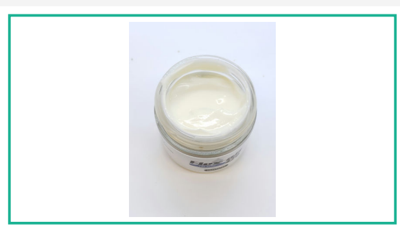
Sampling Conditions: 57g per unit